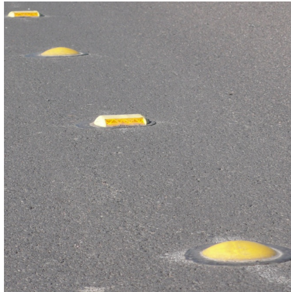
Fig. 3. Raised pavement markers

considered here is a simple round, domed marker. It is made from a non-reflective material and mounted with a bituminous or epoxy adhesive to an asphalt or concrete surface (ODOT 2010). The California Department of Transportation estimates that there are about 20 million Botts' dots on its roadways today (Caltrans 2010). That is enough to form a continuous line of Botts' dots stretching the length of US Interstate 5 from the US-Mexico border all the way to Tacoma, Washington.