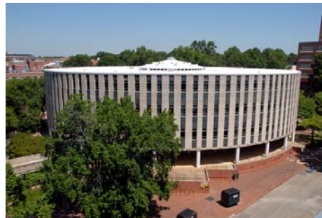
The Department was housed in Harrelson Hall between 1961 and 1981. Harrelson is slated for demolition during the next few years.