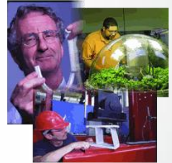
NCARS Weather & Climate Network