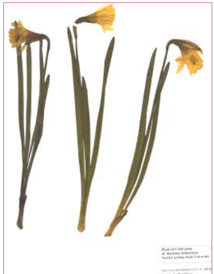
Above: One of over 125,000 herbarium vouchers at NCSC.