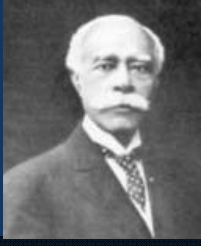
John R. Lynch 1 st National Political Party Convention Chair 1884 Republican Convention Also a U.S. Congressman – Elected in 1973