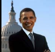
President Barack H. Obama 1 st African American U.S. President 2009