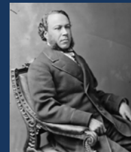
Joseph R. Rainey 1 st Member of U.S. House of Rep. – SC 1870 Also 1 st African American to preside over U.S. House of Representatives in 1974