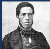
John Mercer Langston 1 st Local Elected Official – OH Town Clerk 1855 Also 1 st African American attorney in Ohio