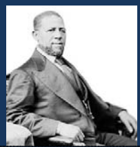
Hiram Rhodes Revels 1 st U.S. Senator/Congressman – Mississippi 1870