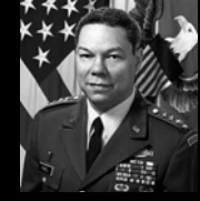
General Colin Powell 1 st African American Secretary of State 2001

Calendar Information & Photos Retrieved From: www.africanamericans.com www.7dvt.com www.johnsonspot.com www.sos.louisiana.gov www.blackpast.org www.aaregistry.com www.americancivilwar.com www.loc.gov/tr/main/republican_co www.bookrags.com www.depa.uw.edu/photos www.britannica.com www.i.pbse.com