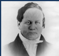
Alexander Lucius Twilight 1 st State Elected Official – VT Legislature 1836 Also 1 st African American to receive a college degree