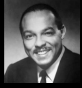
Carl B. Stokes 1 st African American Mayor Cleveland, OH 1967

This calendar is sponsored by the Office of African American Student Affairs Pick up your 2009 Pocket Calendar in the Office of Multicultural Student Affairs