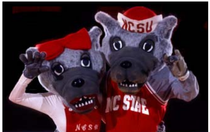
Ms. Wuf pictured here with Mr. Wuf.

Bring your camera! There will be a special appearance by Ms. Wuf! For more information and a list of the pre-college programs, visit our web site ( http://www.ncsu.edu/precollege ).