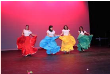
Folkloric Dance Group