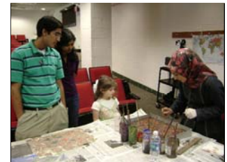
Learning during the event

By the Islam & Dialogue Student Association