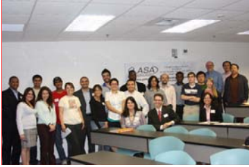
Group of attendees and LASA group