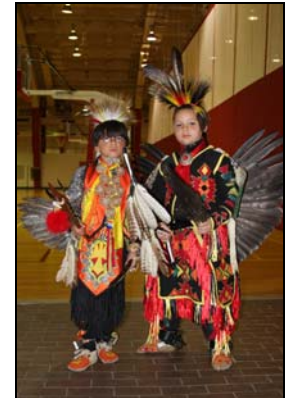
Pow Wow Festival

Read complete article here Photos of the event here