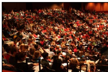
Students at the Pre-departure Orientation

The Study Abroad Office held its largest ever pre-departure orientation for summer program participants on March 26th in Stewart Theater, with over 500 students attending.