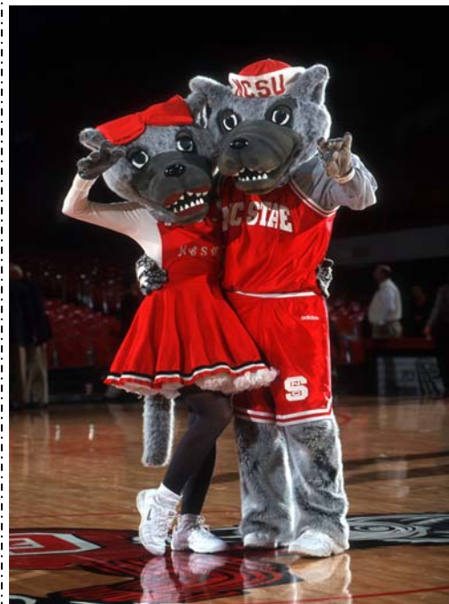
Meet our mascots, Mr. and Ms. Wuf!

(This song is commonly sung at NCSU sporting events and references our closest school rivals: UNC, Duke and Wake Forest.)