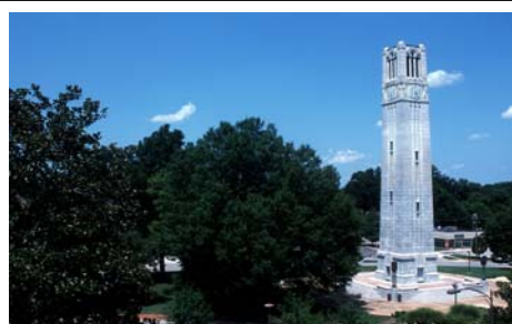
The Bell Tower at NC State