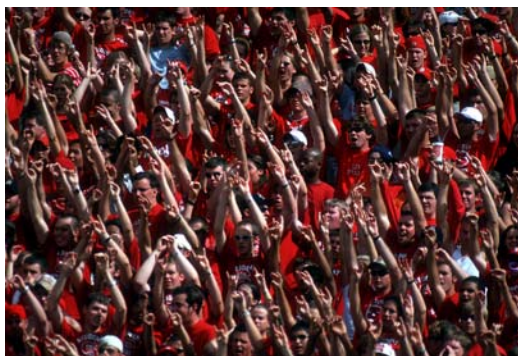
The student section at a NCSU football game