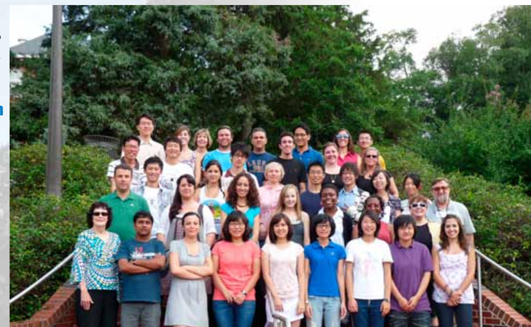
Participants and staff of the 2009 Summer Institute in English pose for a class photo.

The residence hall will be open three days prior to the beginning of the Institute. Students are encouraged to