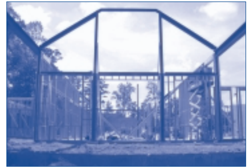
Park Center Exhibit Hall South Entrance