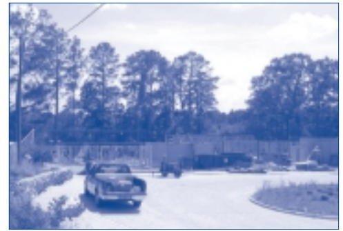
Park Center Education Wing

Preparations are underway for the grand opening celebration. Please plan to join us in May 2005 for the festivities. Be sure to check for future announcements about the grand opening event. Updated information on new park programs and special events will be posted in both the YMA quarterly newsletter and the PROS' Parks Quarterly newsletter, as well as on the Wake County website ( www.wakegov.com ). Please also feel free to call park staff at (919) 856-6675 for more information. ■