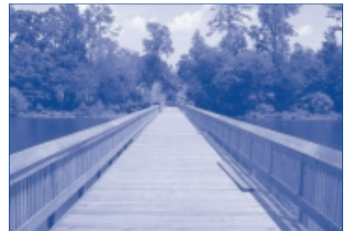
Pond Boardwalk From West