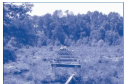
Wetlands Boardwalk From East

"Business Planning" continued from page 2