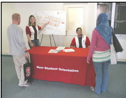
Students receive help at orientation.

Each year, NSO requests the assistance of students, faculty, and staff to serve as volunteers during their two-day Orientation programs. NSO invites you to donate a couple of hours of your time to enhance the experience of the incoming students and their families. To learn more about volunteering and to sign up to be a volunteer, please visit the website ( http://www.ncsu.edu/orientation/volunteers/index.htm ) and complete the online application form.