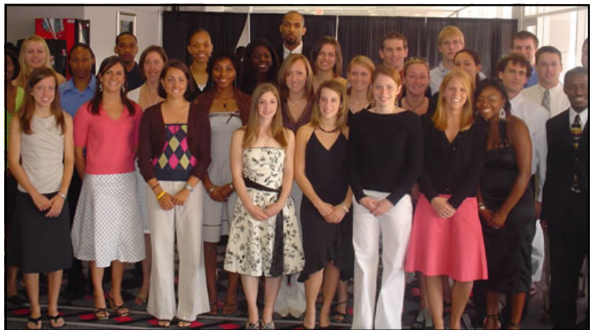
Graduating Student-Athletes, Spring 2006