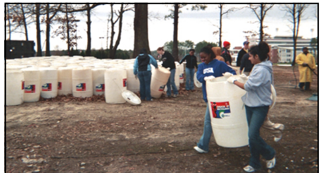
Orientation Counselors help the Office of Waste Reduction and Recycling with the "Chuck It" Recycling program.