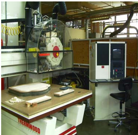
Turret Router used in Study

This research included an evaluation of various sensors for tool condition monitoring and the development of an on-line control system to maintain product quality. Both experimental work and analytical modeling of the routing process of melamine-coated particleboard were carried out to implement the monitoring and control system. Work to date has shown that an accelerometer mounted on the spindle can be used not only to alert an operator that the tool is becoming worn but can also be used as input for a closed loop system that can control the spindle speed to maintain product quality as the tool wears.